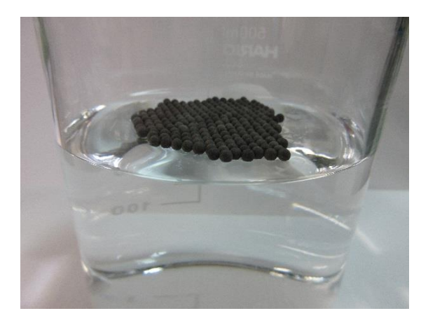
Hydrophobic precious metal catalyst floating on water